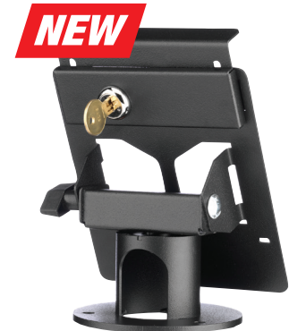
Locking Payment Terminal Stands Mount EMV-Ready payment terminals to our lockable stands to help prevent unauthorized access or removal